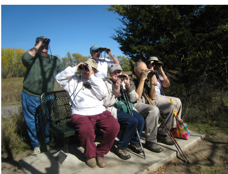
OK, we did pose for this one!