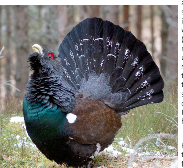
By sighmanb- Capercaillie, CC BY 2.0, https://commons.wiki-

* California's northern forests are habitat for the sooty grouse, a subspecies of the blue grouse, that also consumes pine needles in winter months. The dusky grouse, the other subspecies, lives in the Rockies.